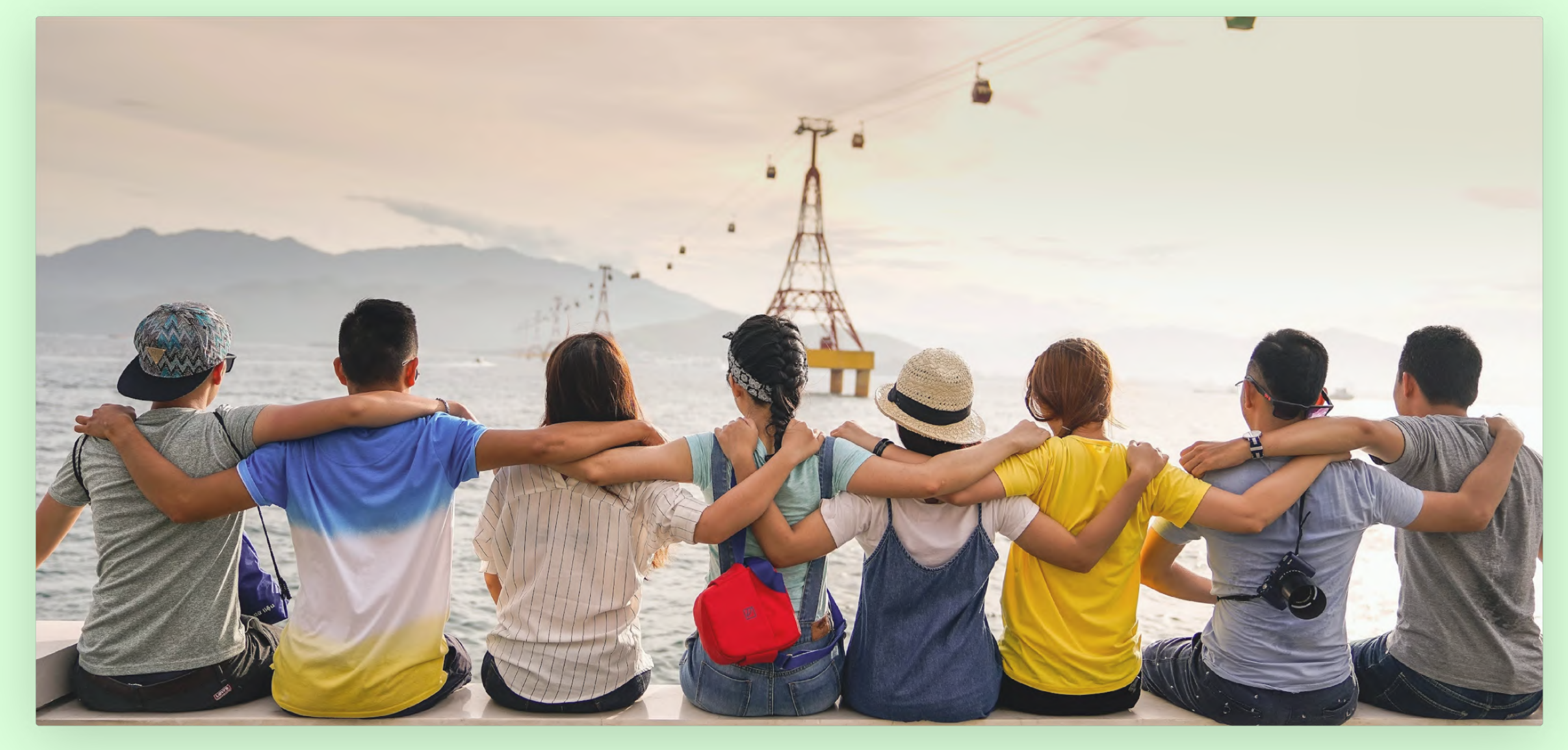
Clover Crew: Charity brings income